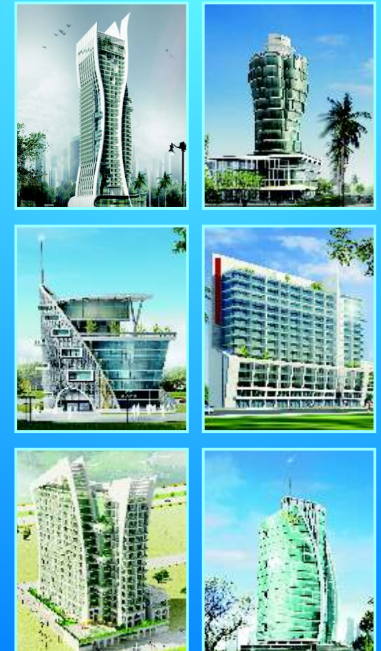
Proposed tower images

And to unveil this extensive package of business prospects, recreational opportunities and rich hospitality, Global Business Park unlocks its sky-scraping first business hi-rise