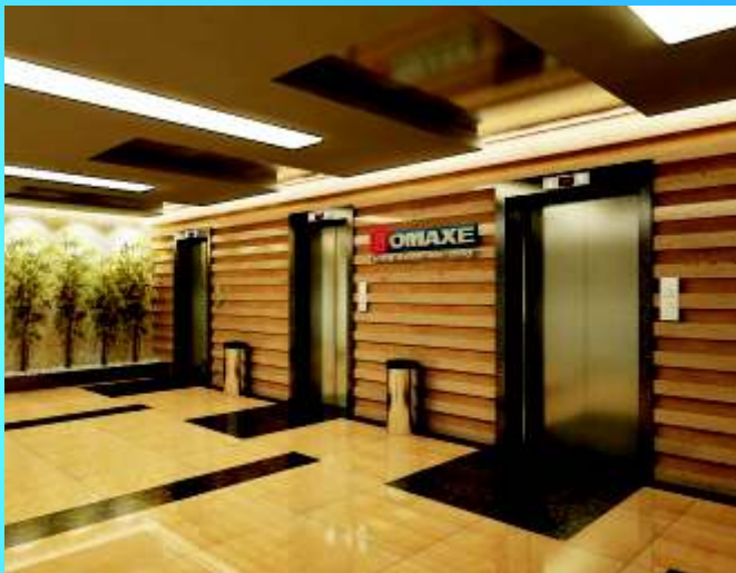
Efficiently organized core and flexible lift clusters connecting 19 magnificent floors