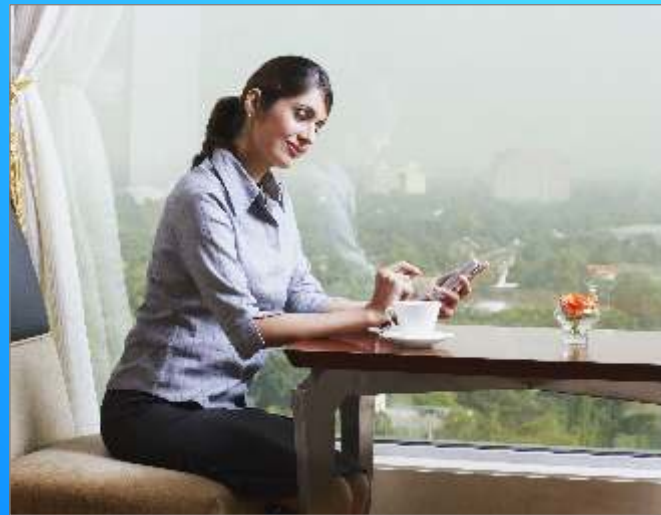
Greater daylight penetration for buildings with scenic beauty to relish