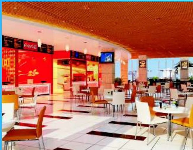
Food courts rich flowing with delicious recipes to help you re-collect yourself