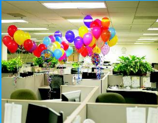
Office spaces so comfortable that may turn you workaholic