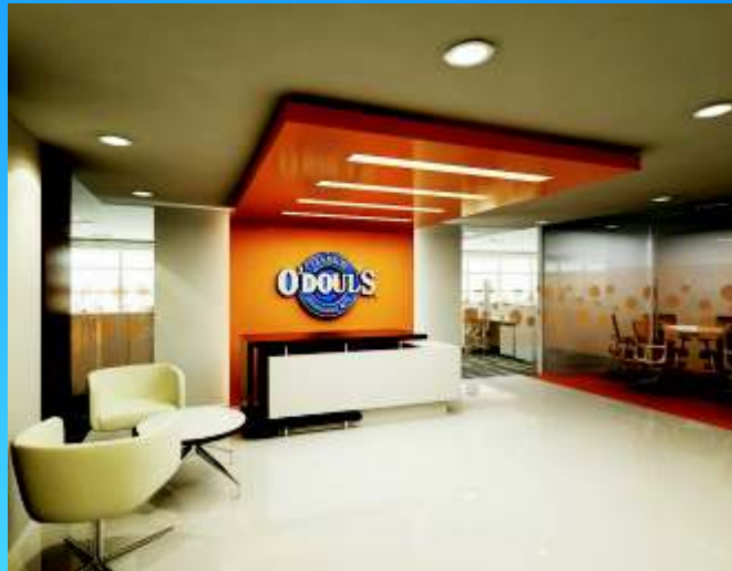
Architecture & Design that even the connoisseurs will admire