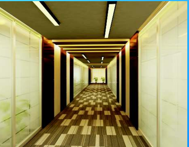
Grand passages that provide fluency to walk-ins and outs