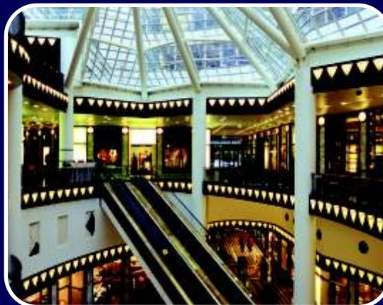
Plenty to Amuse