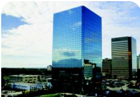
Terrific Work Space