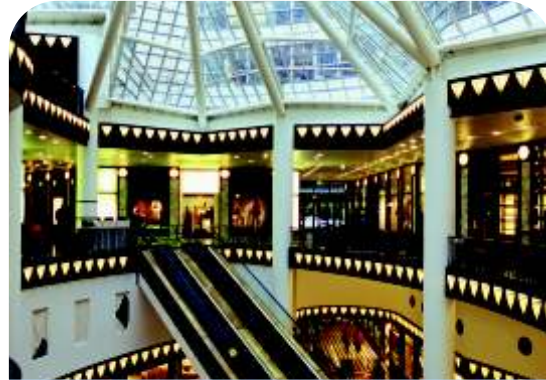
Plenty to Amuse