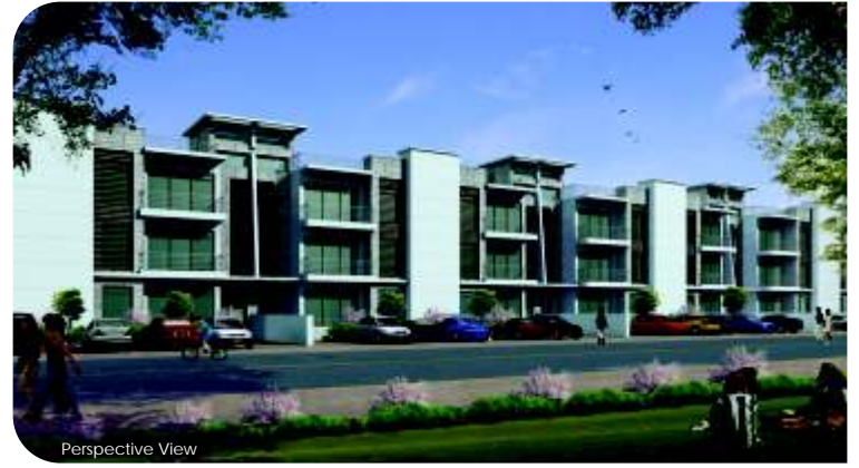
G+2, Independent Floors