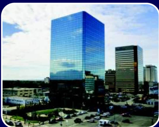
Terrific Work Space